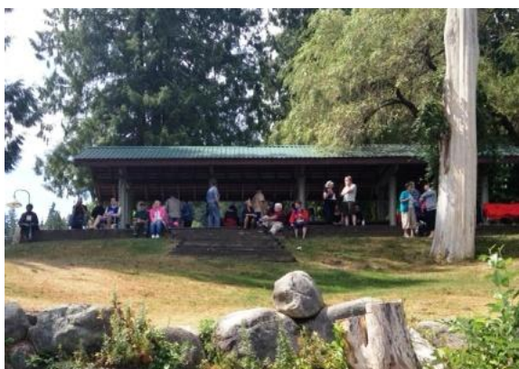
First United Picnic at Panorama Park on August 16, 2013