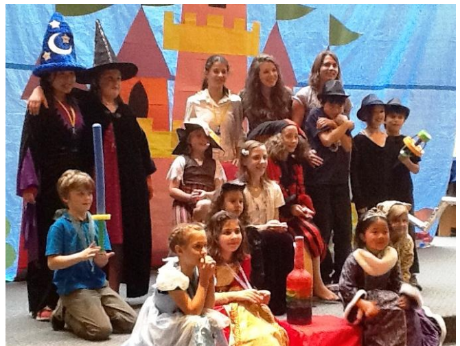
Bottle of Joy Musical held on May 12