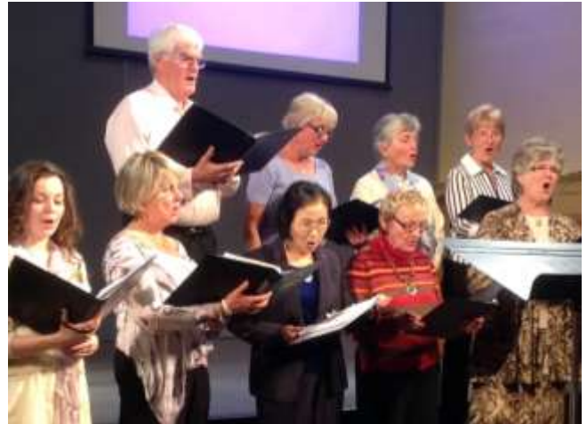
Joyful Noise at St. Andrew's 100th Celebration

Andrew's United Church 100 th birthday, where choirs from most of the United Churches on the North Shore came together to create one