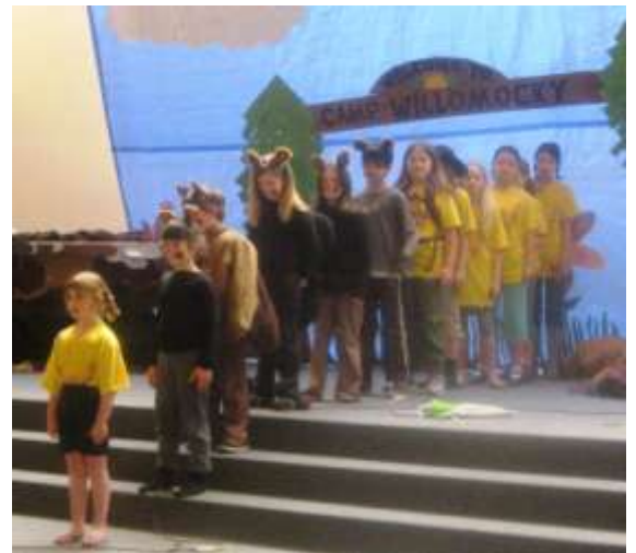
Camp Willomocky Pageant - May 2012