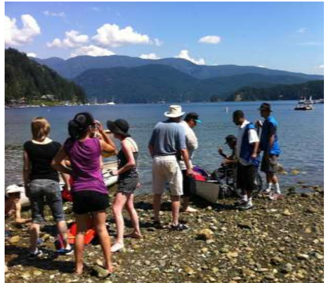
First United Mission Picnic at Panorama Park - Aug. 4

The Giving Tree at Christmas was again well decorated with appropriate donation to First Church and to The Lookout Shelter here on the North Shore.