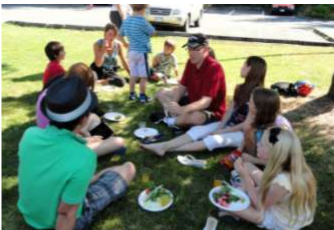
Church Picnic - June 2011