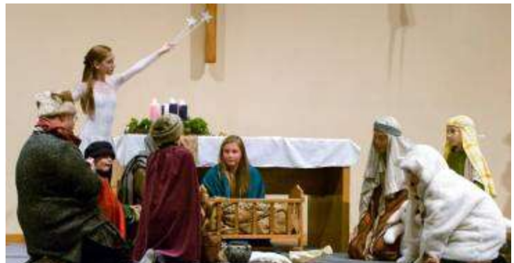
Christmas Eve 2011