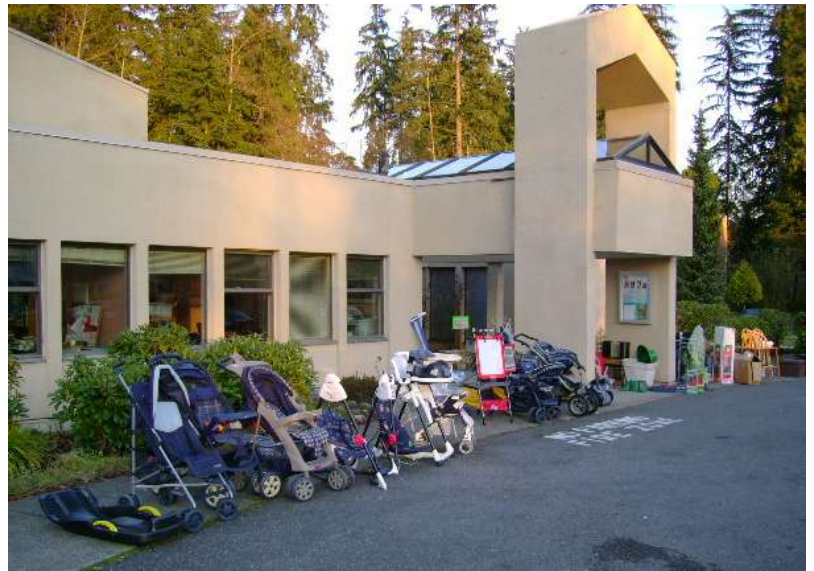
Thrift Shop - Dec. 9, 2011 Ready for Business!