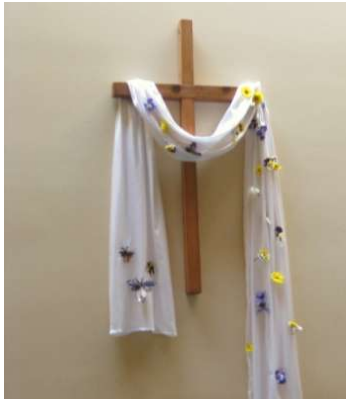
Easter Sunday cross