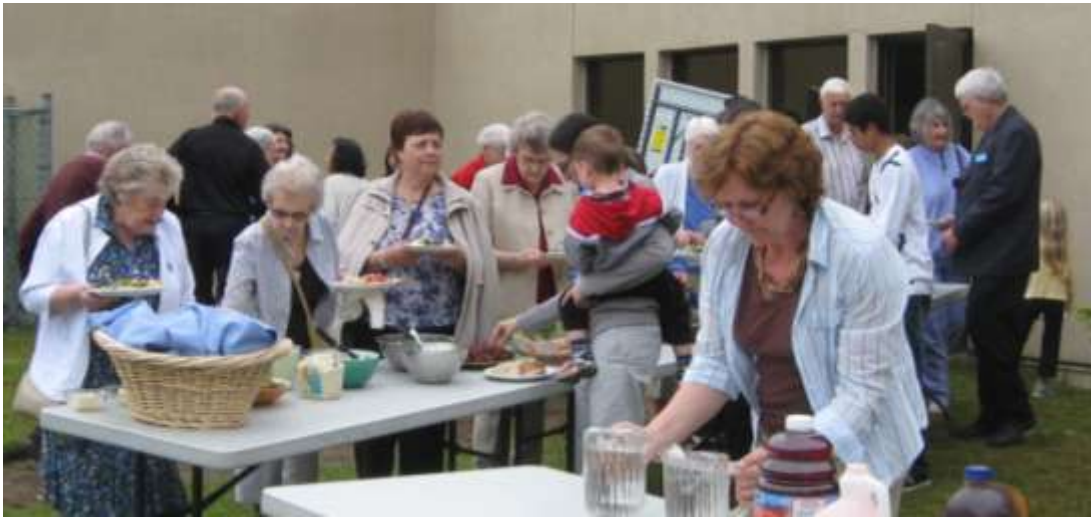
Church Picnic – June 2010