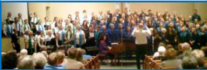
Making a Joyful Noise! - May 1, 2009