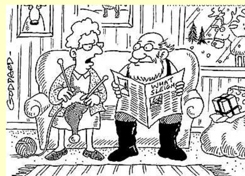
"and I suppose you'll be working again this Christmas?"

There are tons of creative ways you can participate in telling the Christmas Story in our Advent and Christmas Eve services this year - through music, drama, scripture reading, prayers, poetry, background assistance, playing instruments and more! Email bethel.myseymour@gmail.com to find out how you can share your gifts this season.